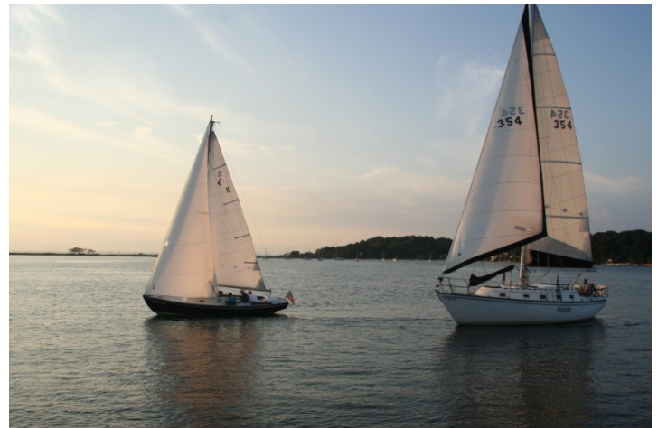
Shadow and Chutzpah upwind in light air at the August 27 Bay Race.