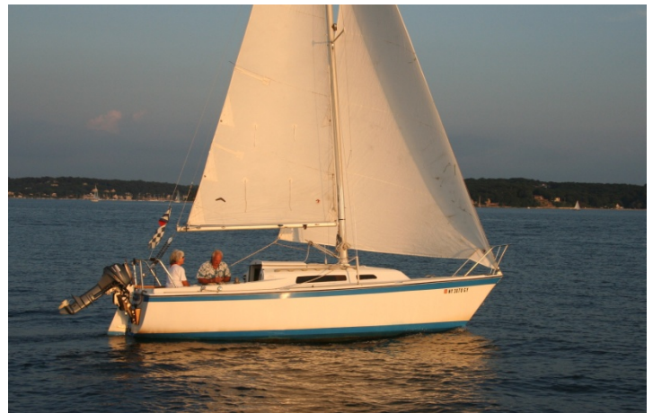
Miss Conduct ready to go at the August 27 Bay Race.