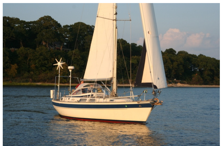
Mercy in light air at the August 27 Bay Race.