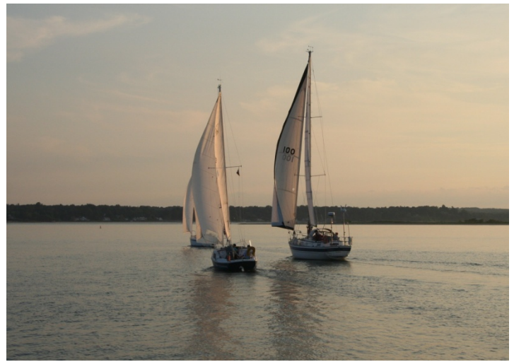
The fleet heads for the first mark at the August 27 Bay Race.