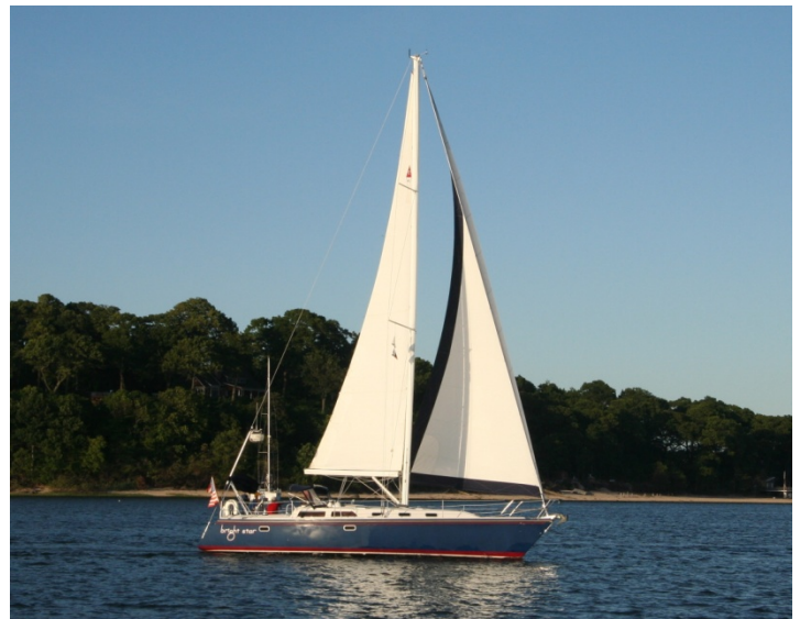
Bright Star in the June 6 Bay Race.