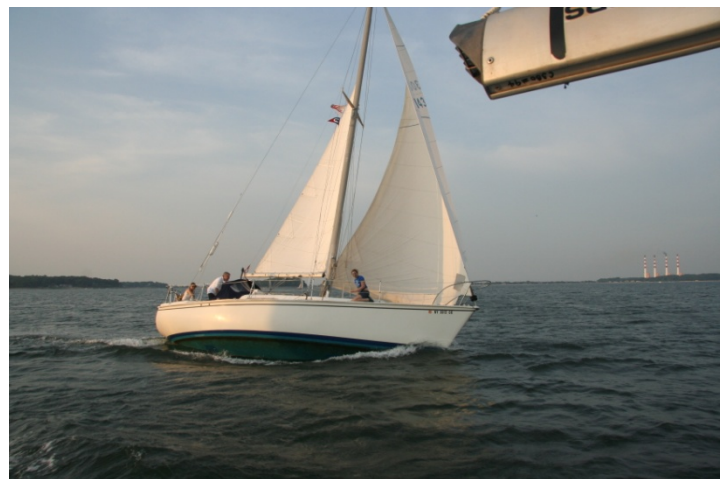
Rose of York abreast Wings races for the second mark in the June 25 Bay Race.