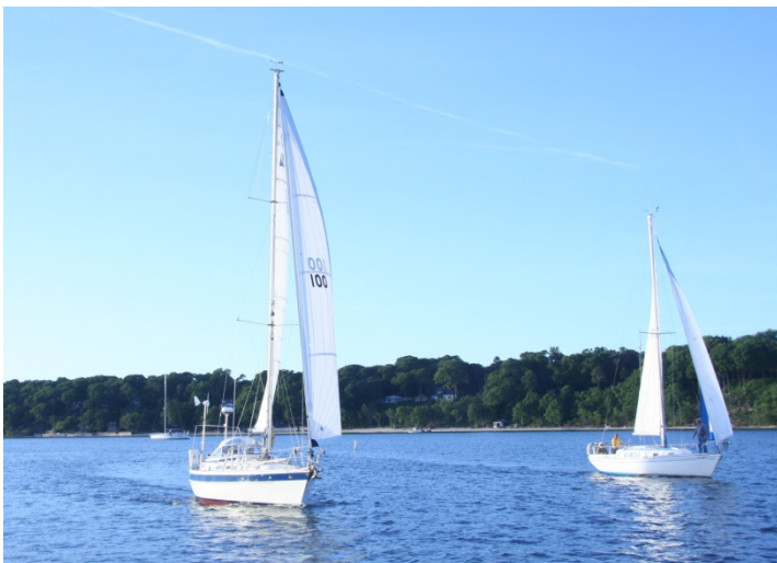
Mercy and Old Friends at the start of the June 4 Bay Race.