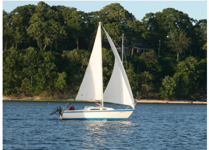
Miss Conduct in the June 4 Bay Race.