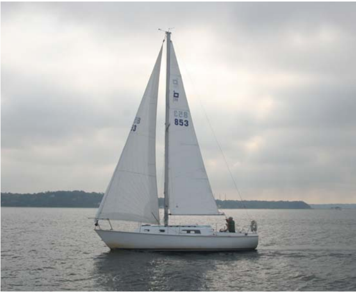
Elixer at the start (Adair Cup Race)