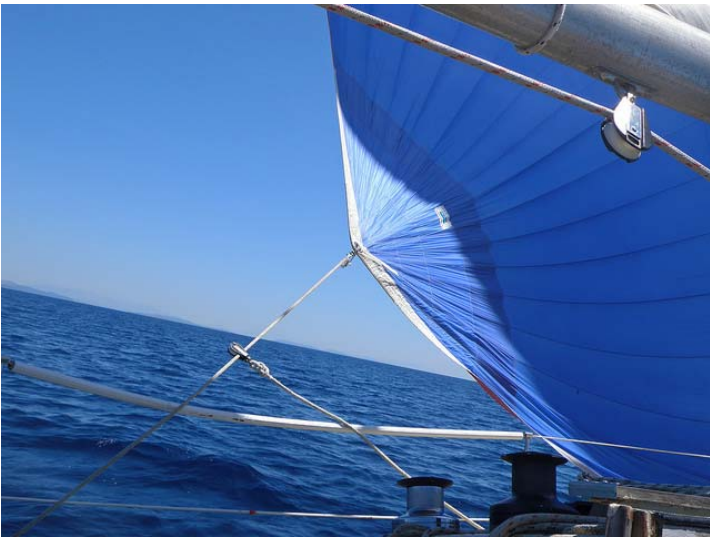
Something to look forward too!!