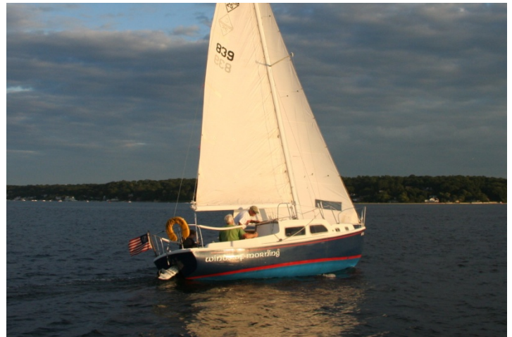
Winds of Morning sporting a really clean bottom in July 13 Bay Race.