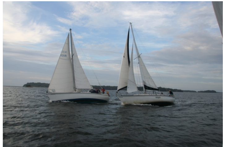
Rose of York and Chutzpah head for the 2nd mark on the July 13 Bay Race.