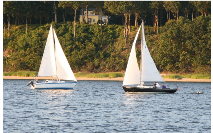
Miss Conduct and Shadow passing close at the August 13 Bay Race.