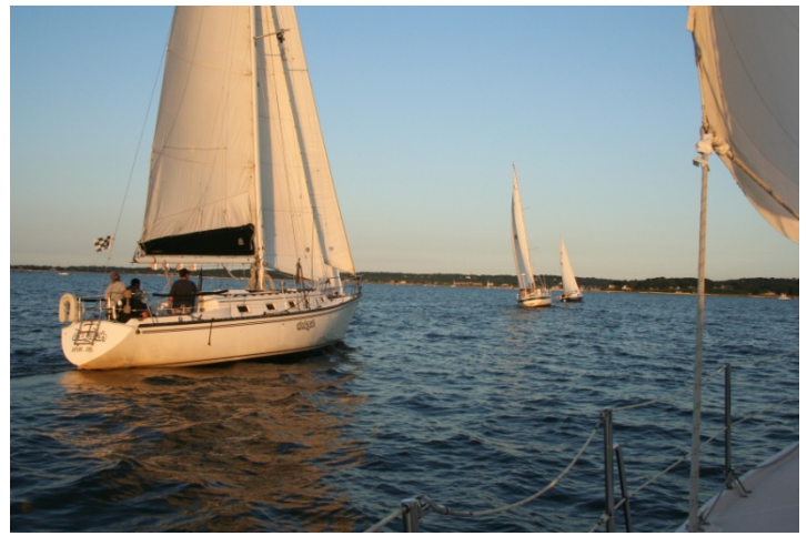
The fleet heads for the first mark with Winds of Morning in the lead at the August 13 Bay Race.