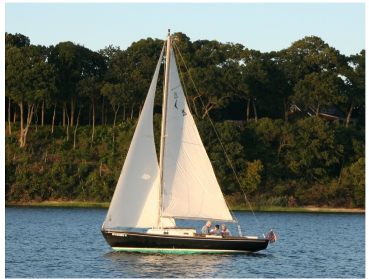
Shadow checking charts before the race.